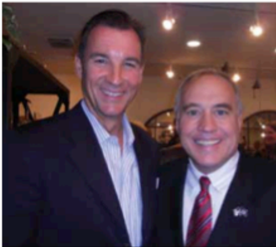
Tom Suozzi and NYS Comptroller Thomas DiNapoli